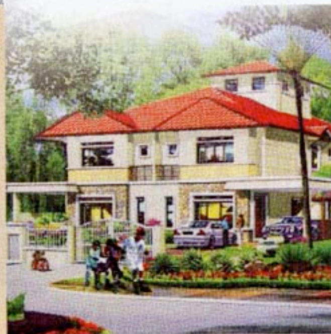
An artist's impression of a 2½-storey unit