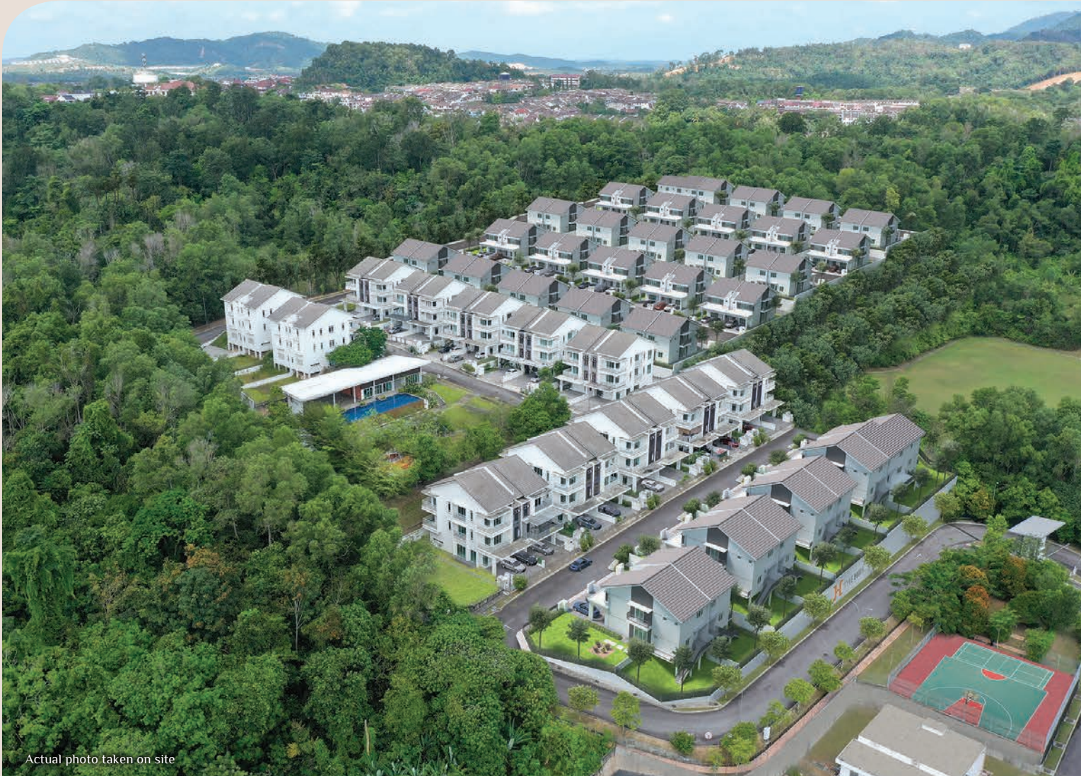
Actual photo taken on site

Live in a gated and guarded environment with exclusive clubhouse facilities designed for wellness, leisure, and family bonding.